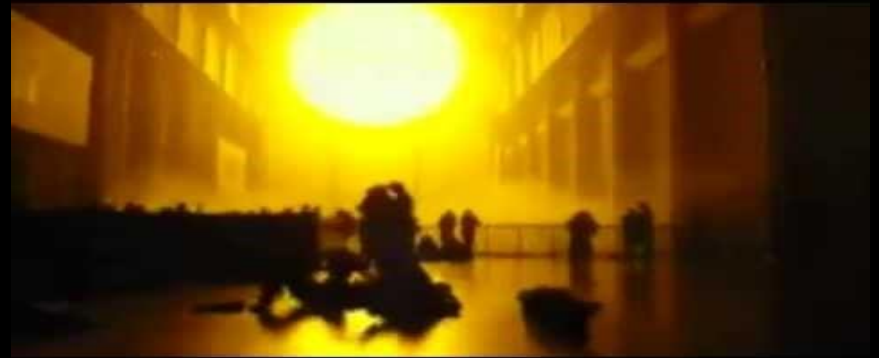
The weather project, 2003

A Danish-Icelandic artist known for large-scale installation and art sculptures. He's interested in duration, temporality, and how our experience of time co-produces space