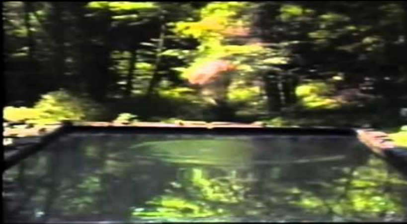
Reflecting Pool, 1979

An American contemporary video and sound artist whose artistic expression depends upon sound, electronic, and image technology in New Media.